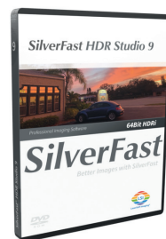
SilverFast HDR Studio